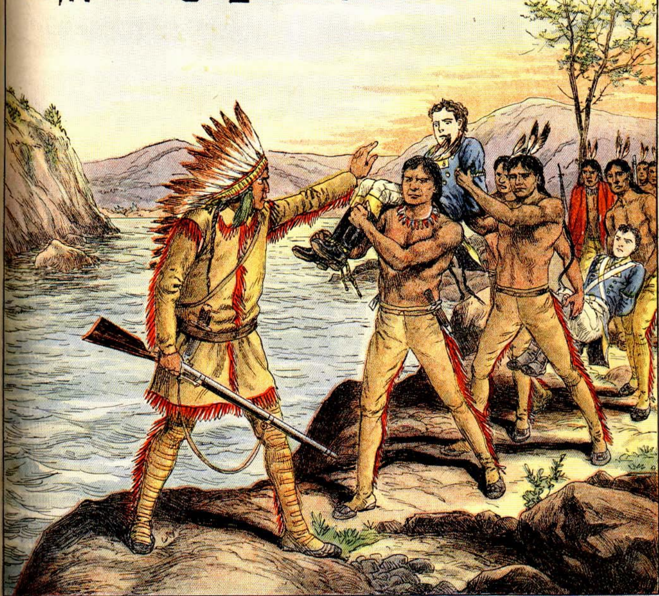
As the Mohawks were hurrying to the brink of the river to cast Dick into the water, the chief suddenly appeared before them. "Stop!" he said, with a gesture of command. "I am the white boy's friend."

THE LIBERTY BOYS AND MOHAWK CHIEF, OR, AFTER ST. LEGER'S INDIANS. BY HARRY MODRE.